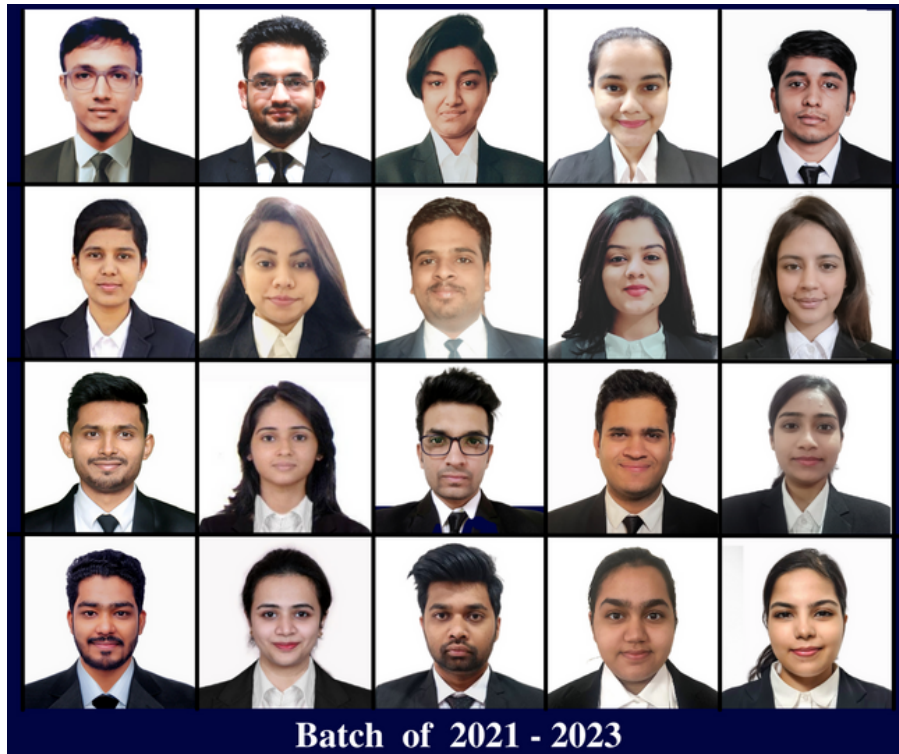
Batch of 2021 - 2023