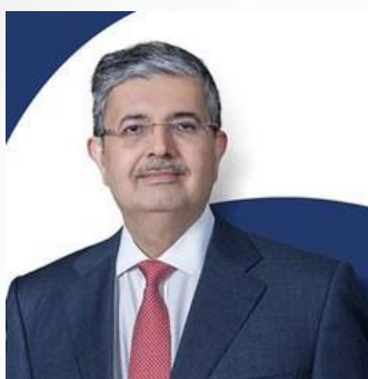
UDAY KOTAK MD, Kotak Mahindra Bank