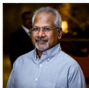
MANI RATNAM Indian Film Director