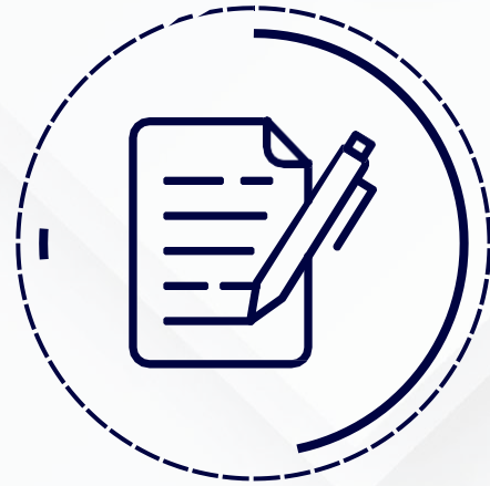
Writing Ability Test (WAT)