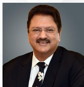
AJAY PIRAMAL Chairman, Piramal Group