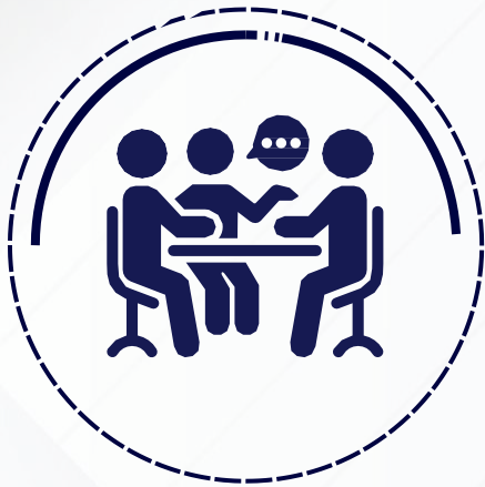
Group Activity (GA)