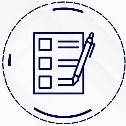
CET, CAT and Profile based Screening