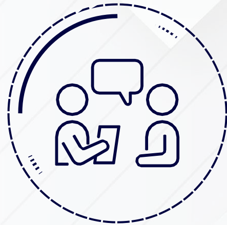
Personal Interview (PI)